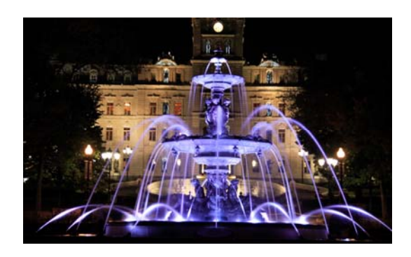
Let us be part of you next Great Adventure!

Call us now for your own customize quote at 1.800.638.3945